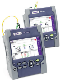
One-slot handheld modular platform for fiber network testing