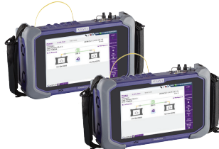
Modular Test Platform designed for the installation and maintenance of wireline and wireless networks